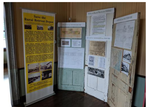
Exhibit of Depot origins: from the V&T RR, to the OMA&O, to the N&W