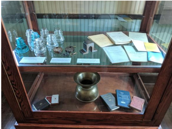
Variety of Railway Artifacts