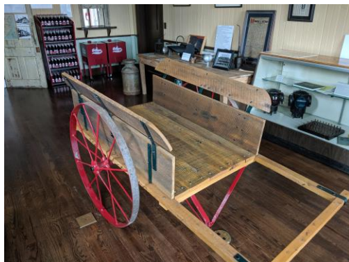
A restored mail and baggage cart