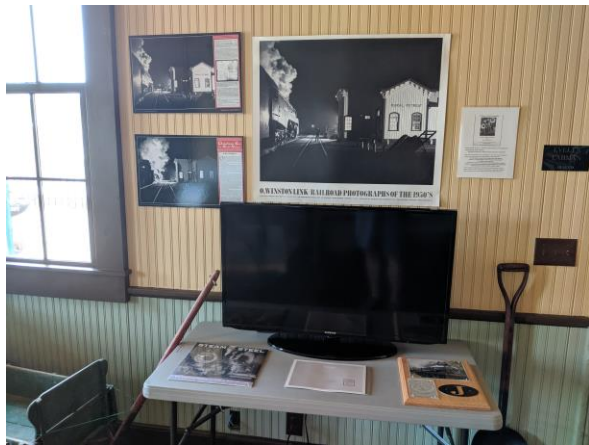
O. Winston Link