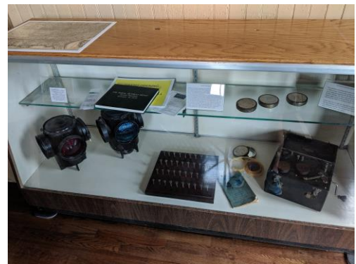
Signaling and Telegraph